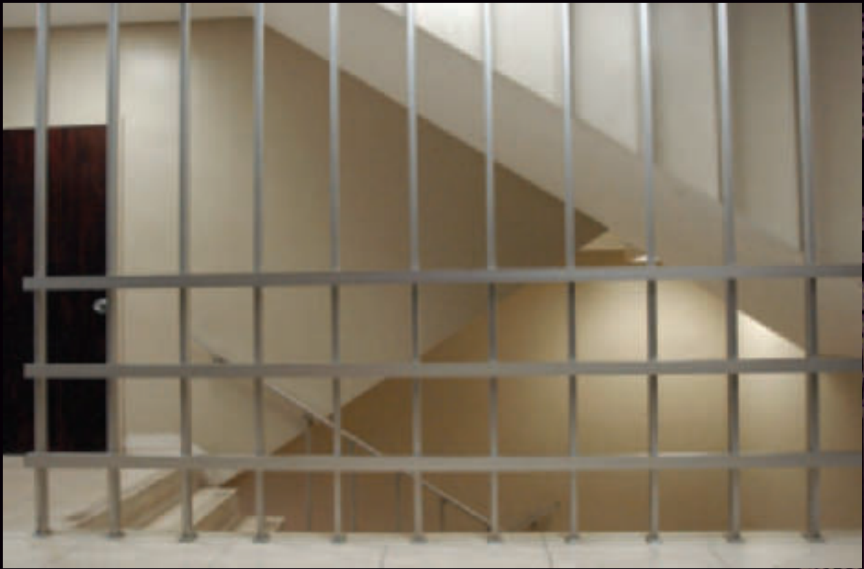
Another example of geometric design: the staircase is accented with a metal rendition of the building's exterior concrete screening.