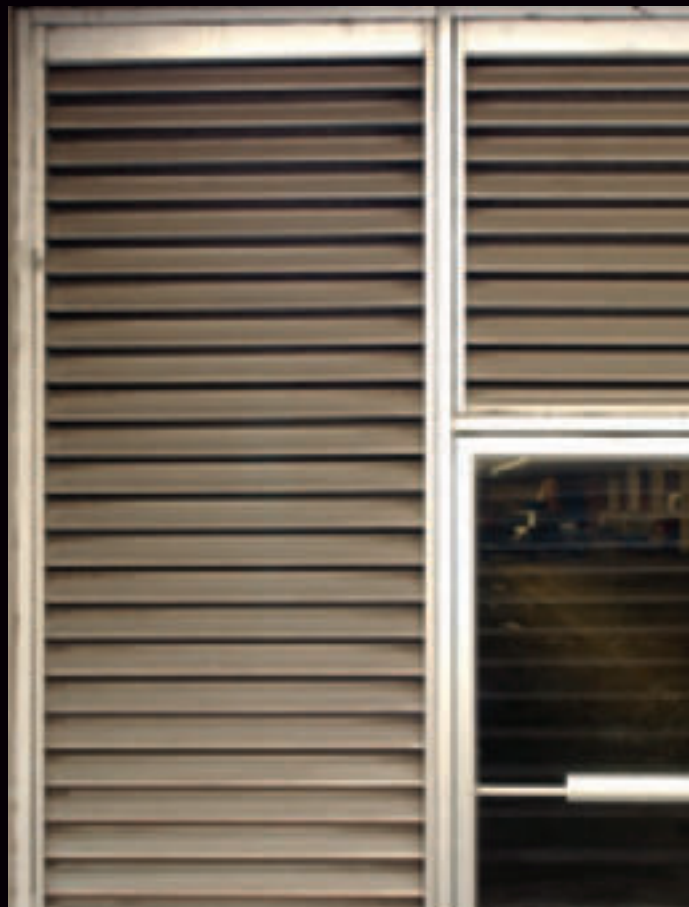
Only from the below ground entrance (screened horizontally in keeping with the courthouse's facade) is the parking garage visible. ★