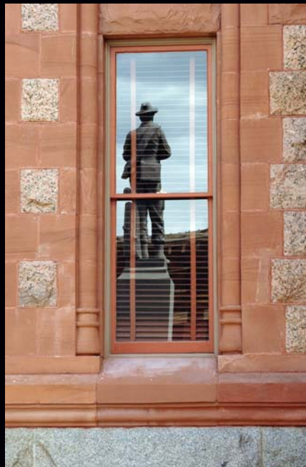
Narrow windows accentuate the imposing appearance of Romanesque architecture.