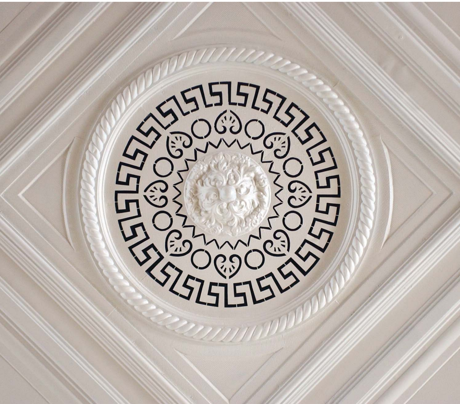
Medallions, ornamental plaques that represent an object in relief, are often found in the interior of Second Empire buildings. This circular medallion graces the courtroom ceiling of the Caldwell courthouse.