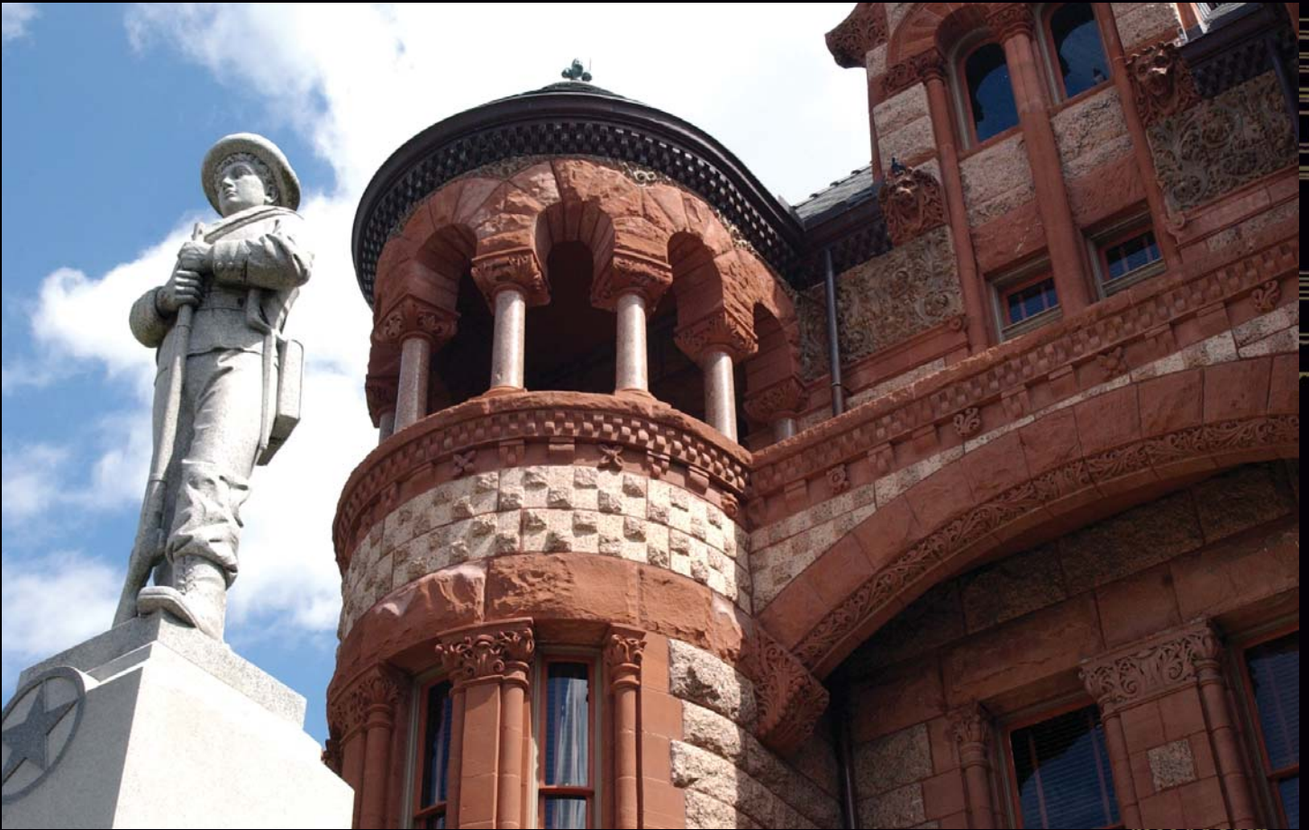
The Romanesque Revival style is castle-like in appearance with hallmark Roman arches, thick walls of rusticated stone and thin turrets with conical roofs.

Architect J. Riely Gordon required stone from various quarries to be used in the construction of the Ellis County courthouse. Gray granite, rose pink granite, Burnett County limestone and Pecos red sandstone provide contrasting colors and textures throughout the building. Pattern and elaborate detail within the masonry were also a hallmark of the Richardsonian Romanesque style.