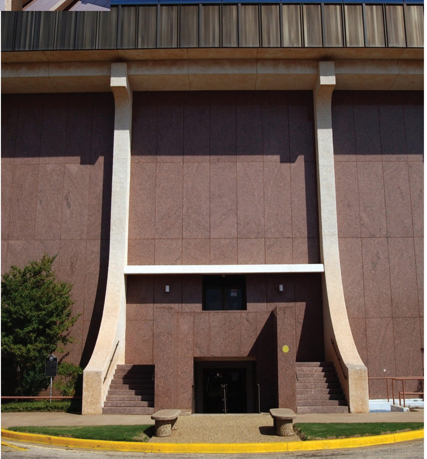
Scurry County Courthouse